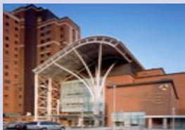
Toronto Western Hospital :University Health Network Toronto, ON