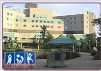
IWK Health Centre Halifax, NS 48 Psychologists