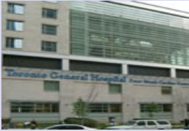
Toronto General Hospital University Health Network Toronto, ON