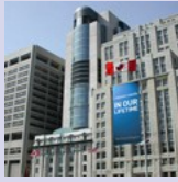
Princess Margaret Hospital: University Health Network Toronto, ON