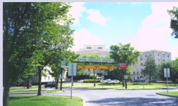
Royal University Hospital Department of Clinical Health Psychology Saskatoon, SK