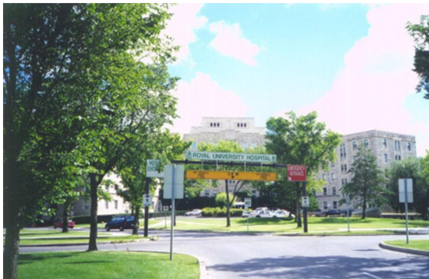
Royal University Hospital, Saskatoon, SK