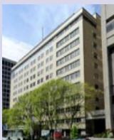
Toronto Rehab Institute: University Health Network Toronto, ON