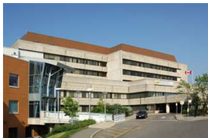
Children's Hospital of Eastern Ontario

Psychologists practicing in hospital settings are very often in the role of leading evaluation and outcome research on the effectiveness of clinical programs. Not surprisingly, previous research has found that potential employers of psychologists at pediatric healthcare centres value training in program evaluation more highly than general research training or allotted time to complete dissertation research during the internship year (Miller, Greenham & Cohen, 2007). Certainly psychologists are well prepared to conduct evaluation and outcome research by virtue of their training within a scientist-practitioner model. However, the importance of program evaluation is also recognized and embedded in psychology training standards, where competency in program development and evaluation is a core domain of professional knowledge and skill to be acquired during the pre-doctoral internship experience, according to the Accreditation Standards for Internships (Canadian Psychological Association, 2011).