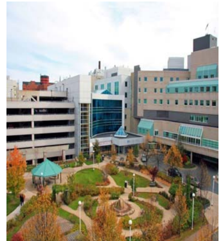
IWK Health Centre in Halifax, Nova Scotia

ning to receive annual progress reports and recognize that many of the limitations prior to this initiative related to productivity remain, i.e., clinical care taking over research time, inability to complete publications. We have implemented research awardee support meetings in an effort to assist with identifying barriers to progressing with the intended research proposal and providing research infrastructure support, i.e., methodology consultation, ethics application support, strategies for balancing of clinical responsibilities.