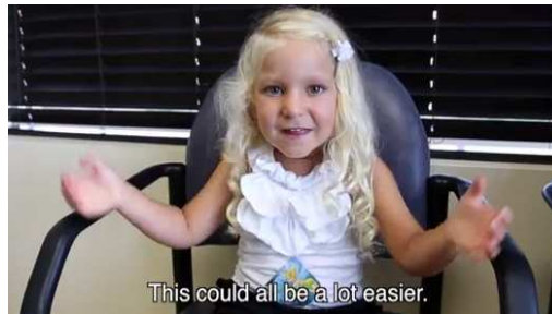
Image 1: In the video, a young girl tells her mom what she should – and shouldn't – do to help make the needle less painful.

Surprisingly, despite the availability of numerous evidence-based strategies for reducing needle pain, fewer than 5% of children receive any kind of pain relief for common needle procedures. In fact, 1 in 10 children and adults develop a significant needle phobia, which interferes with them seeking proper medical care.