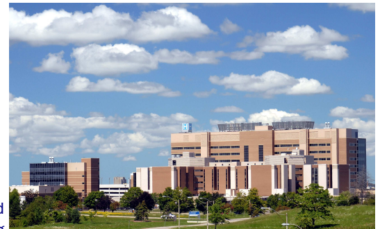
Victoria Hospital, London