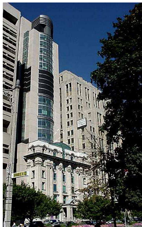
Princess Margaret Hospital (Toronto)