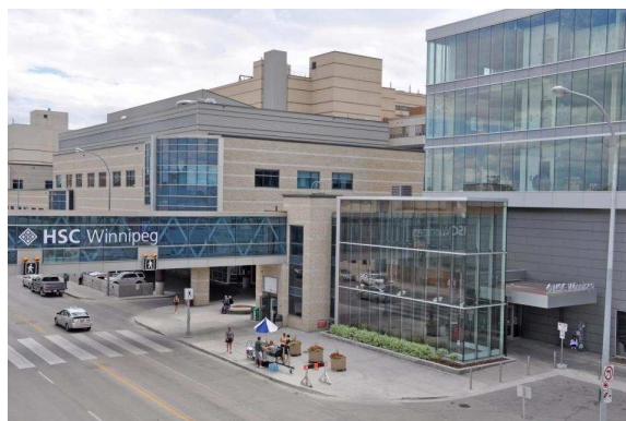
Health Sciences Centre - Winnipeg