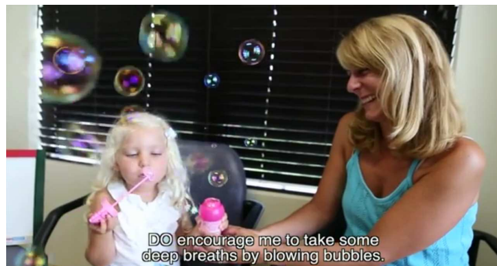
Image 2: One effective pain reduction strategy is blowing bubbles. It combines distraction and deep breathing.

We're also on Facebook ( www.facebook.com/CentreforPediatricPainResearch ) and Twitter (@DrCCChambers; #itdoesnthavetohurt)