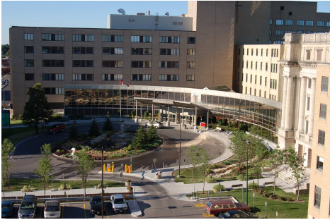
St Boniface Hospital, Winnipeg