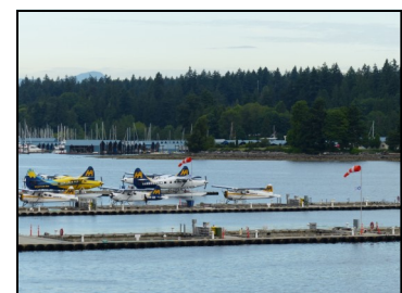
Photo: planes in the Vancouver harbor