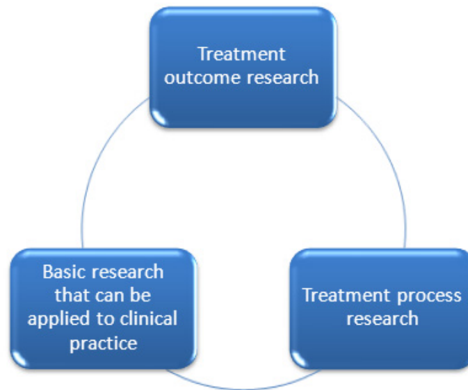
Figure 1. Sources of evidence that inform clinical practice.

Evidence-based practice relies on diverse sources and levels of evidence. First and foremost, this evidence includes research findings published in the peer-reviewed scientific literature. For psychological practice, the evidence to be considered in recommending or providing a treatment should be derived from sources such as treatment outcome research, treatment process research and basic psychological research that can be applied to clinical practice (see Figure 1). Following the initiation of treatment, data should be obtained from the ongoing monitoring of clients' reactions, symptoms, and functioning, and these data should inform decisions about treatment planning, modification, completion and discontinuation.